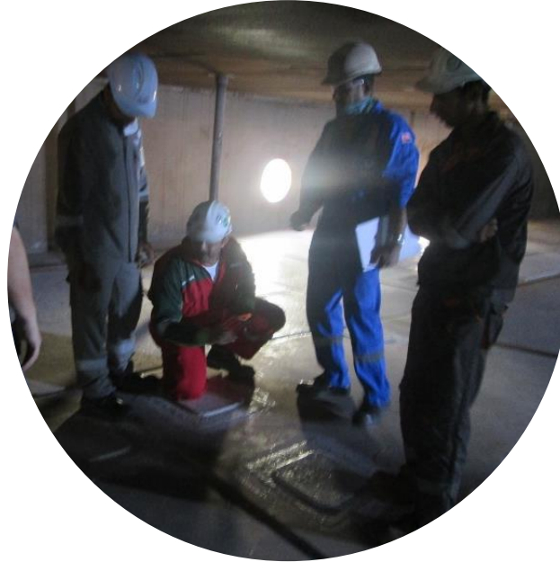
Patch Plate Inspection