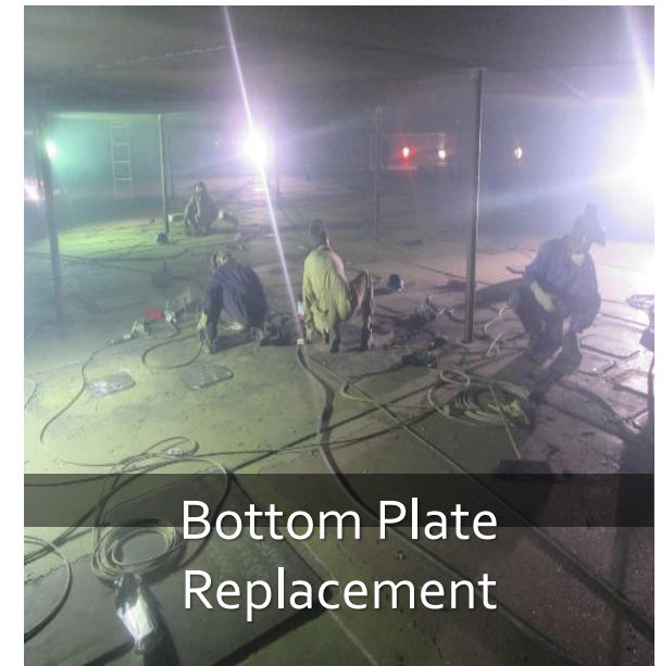
Bottom Plate Replacement